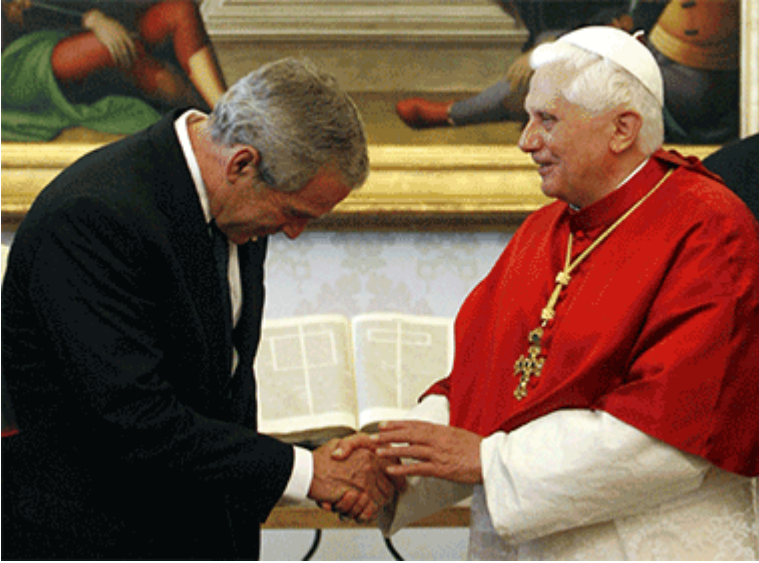
George Walker Bush bowing to Pope Benedict XVI. The Bushs have a covert alliance with the Pallavicinis and the Massimos.