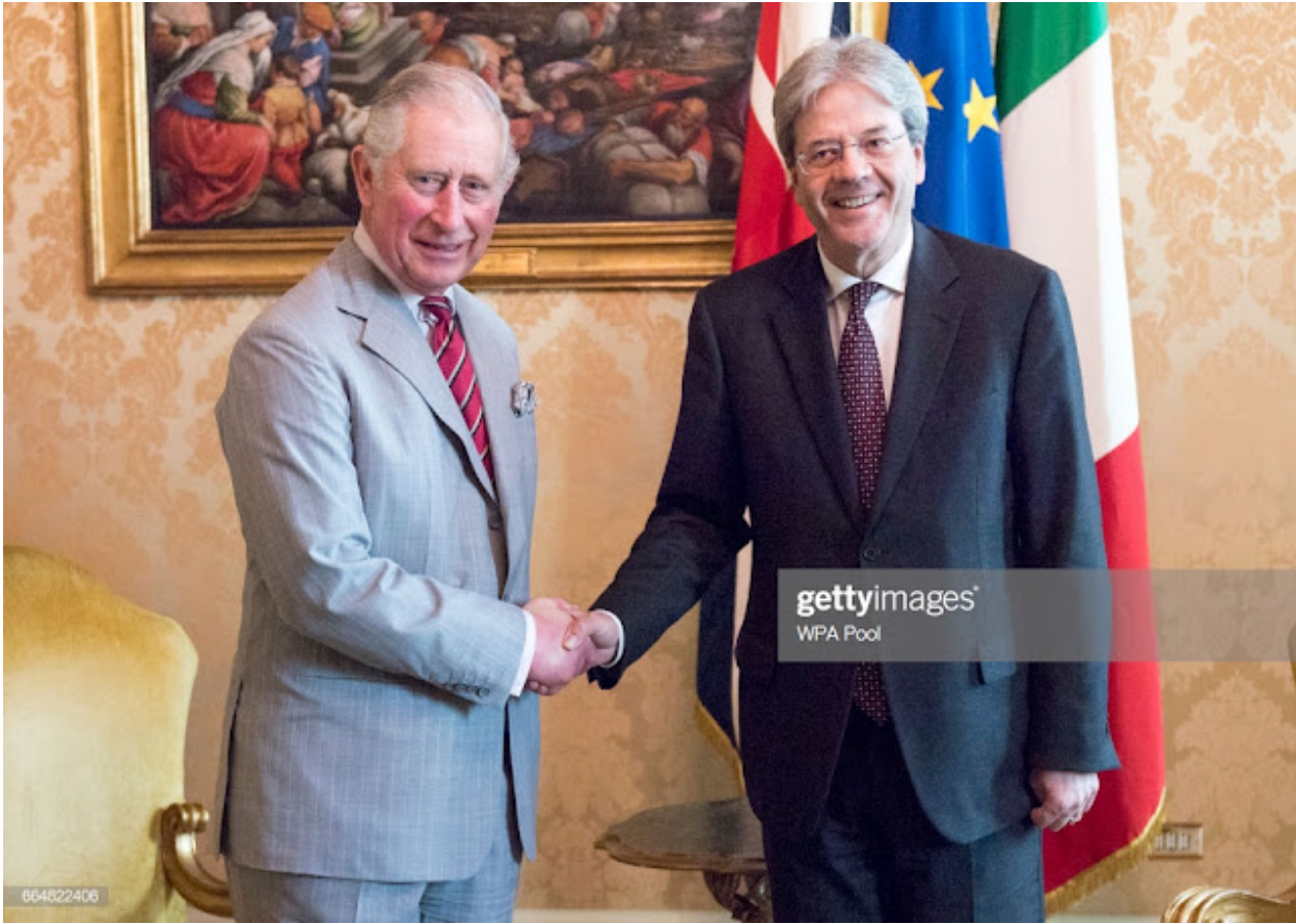
Prince Charles of Wales at the Palazzo Chigi with the recent and former Italian Prime Minister Paolo Gentiloni. The Italian Prime Minister resides at the Palazzo Chigi.