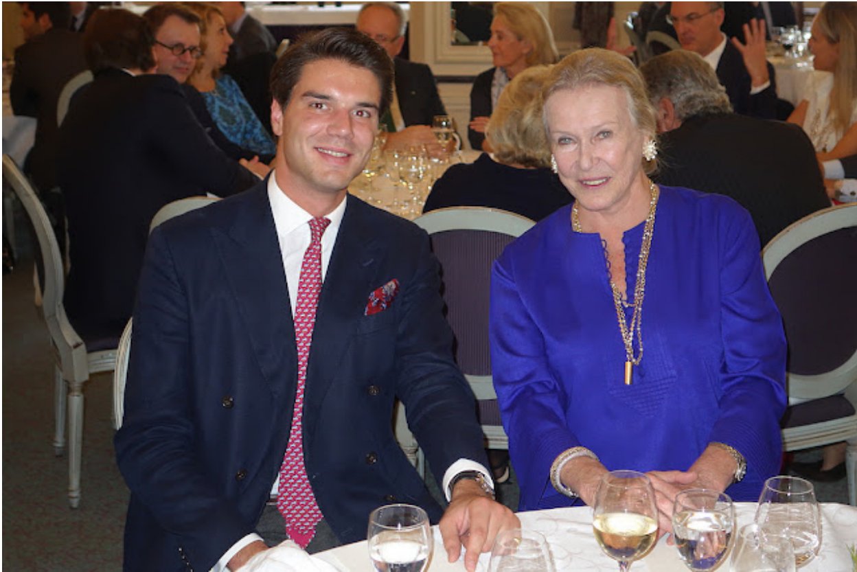
Princess Marie Gabrielle of Savoy with Prince Amaury of Bourbon-Parma at the Swiss Club of Leaders. The Club of Leaders is an international group of royals and businessmen that meet in various European locations to discuss criminal financing and market domination.