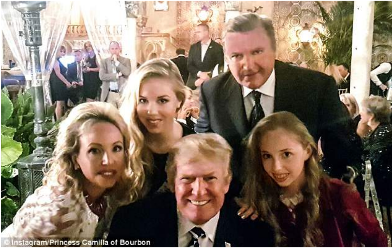
Prince Carlo of Bourbon-Two Sicilies and his family at Mar-a-lago with Trump who was Jesuit educated at Fordham.