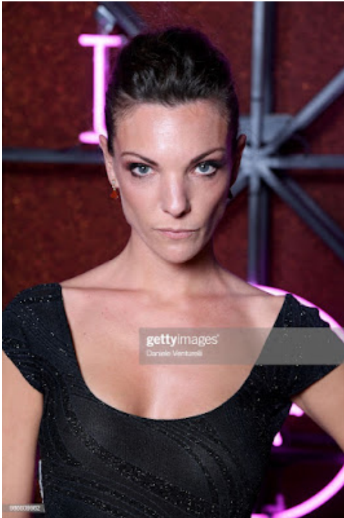
Princess Ginevra Odescalchi