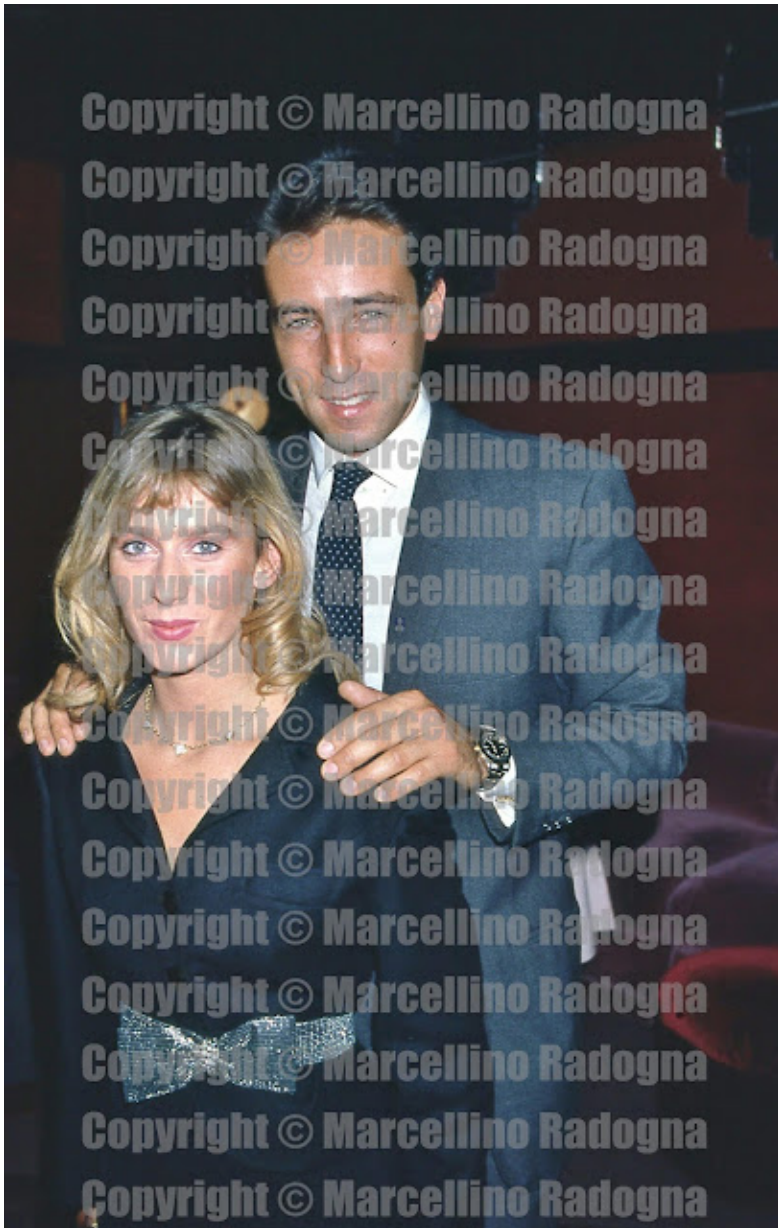
Prince Giovanni Riario-Sforza