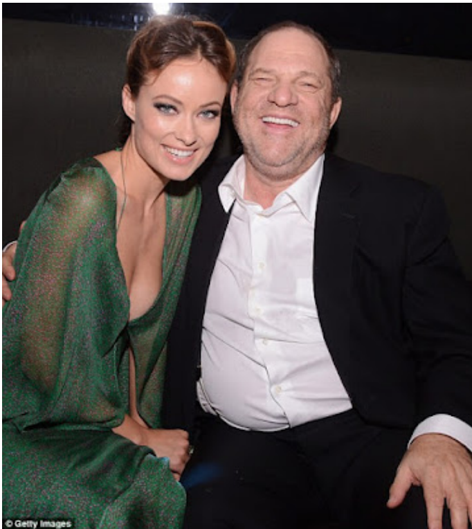
Olivia Wilde with her friend the sexual predator Harvey Weinstein who was knighted by the British Crown.