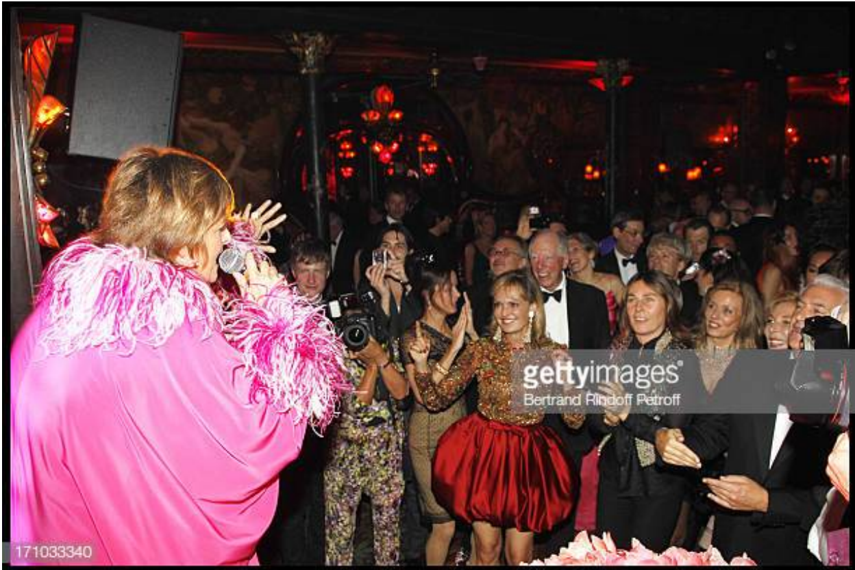
Princess Alessandra Borghese and standing behind her is Jacob de Rothschild at a Thurn and Taxis party in France.