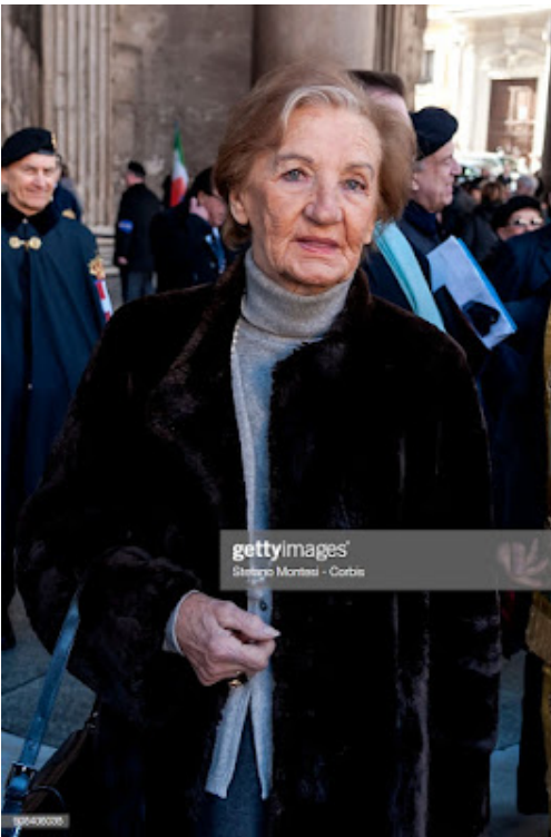
Princess Luciana Pallavicini is married with the royal family of Afghanistan.